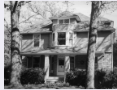
696 Hillside Avenue, torn down June 2002

At the increasing rate that teardowns are occurring, we cannot afford to take a slow approach to addressing the problem. Everyday we are losing resources that can never be replaced. The visual character of our village is being dramatically changed, usually by