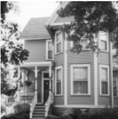
404 Prospect Avenue

It's every home restorer's dream; being able to contact a descendent of the original owner of your home and find out details and information no one else could provide.